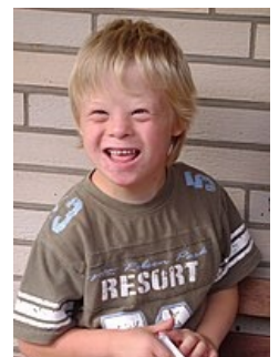
Boy with Down syndrome

underway. On the other side, ovum (female reproduction cell) is present in woman's body from her birth. So the meiosis is under way for years and it is pretty easier to make a mistake. The higher age of the mother, the more meiosis, the higher risk of nondisjunction.