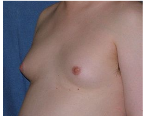
Gynecomastia in 19 year old patient with mosaic variant of Klinefelter syndrome

The genetic disorder itself is irreversible. But testosterone therapy has shown to help with gaining a more masculine appearance: