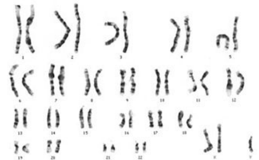
Karyotype of an individual with Klinefelter syndrome (47,XXY)

Some (about 10%) males have only the extra X chromosome present in some of their cells. This is described as mosaic Klinefelter syndrome, and can be described with some variant of mosaic karyotype (e. g. 46,XY/47,XXY). This means that some of the cells from an affected individual will show a normal karyotype, while other cells can show the karyotype of Klinefelter syndrome. These individuals usually show milder signs and symptoms of the condition, but this again depends on the number of cells expressing the affected trait.