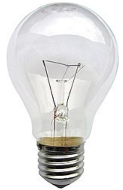
60W light bulb

The efficiency of the light bulb is very low, on the order of 10 lm/W, i.e. that the bulb heats more than it lights.